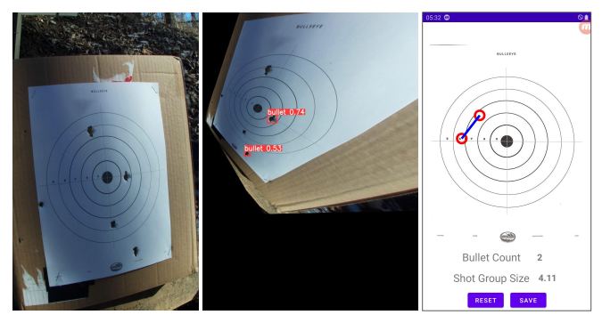
Fig. 5. Results of the Second Outdoor Test

whereas a 2.2k\Omega resistor only detected the gun without a silencer. By populating a 10k\Omega resistor, surrounding noises were filtered while suppressed shots were accepted. Also, the target had a background that confused the image matching algorithms. Due to the features behind the target, the captured image warped poorly, detecting none of the bullet impacts. YOLO V5 couldn't detect bullet holes and calculate coordinates from the mess image. As a result, the mobile application didn't draw any impact.