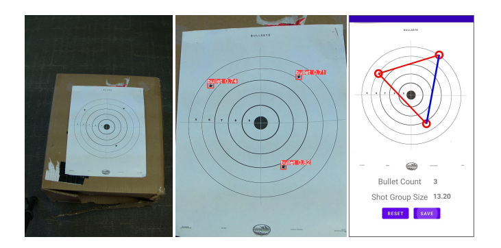
Fig. 3. Results of Indoor Tests

gunfire, activating the sound detector. Fig. 3 shows one of the results of indoor tests, displaying a captured image, an image detected bullet hole after warping, and an application page after one shooting session.