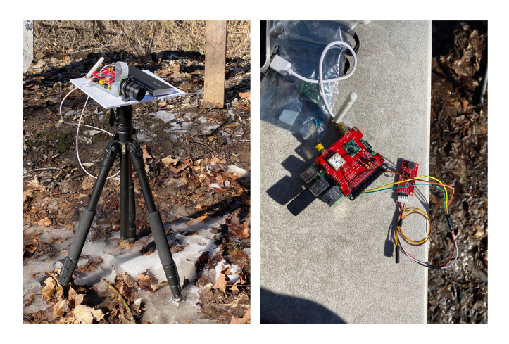
Fig. 4. RPi-1 (left) & RPi-2 (right)

As indoor tests were conducted in a stable test environment, there were no interrupts such as other image features and shadows making the target image to be warped unexpectedly, nor winds and shot impacts moving the targets from their origin placement. The sound detector intentionally triggered RPi-1 via hand clap.